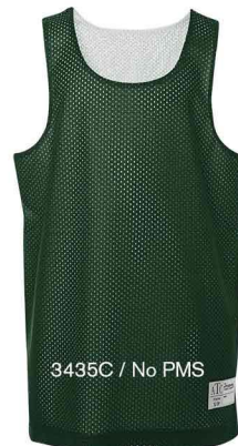
3435C / No PMS