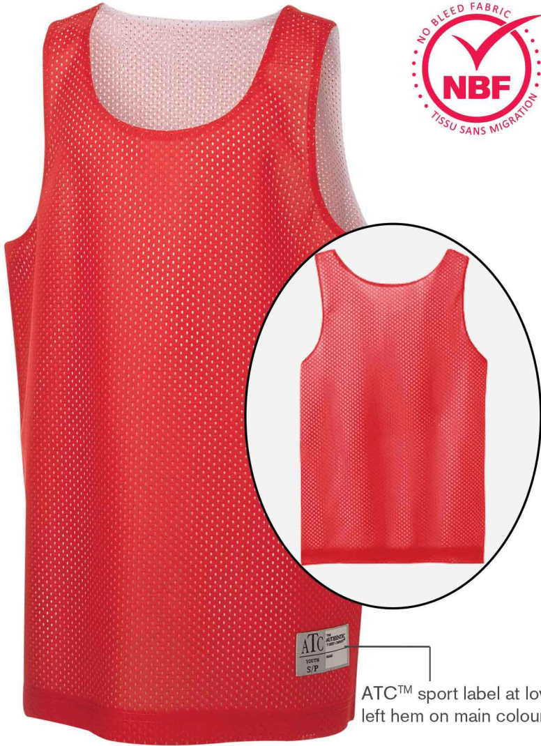
ATC™ sport label at lower left hem on main colour side