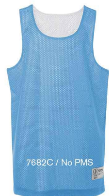
7682C / No PMS

Due to the nature of polyester, special care must be taken throughout the decoration process.