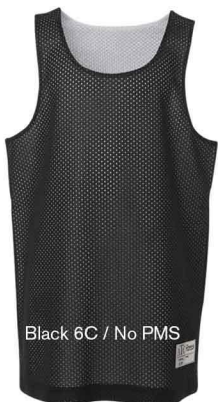
Black 6C / No PMS