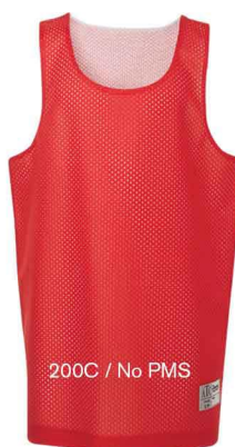
200C / No PMS