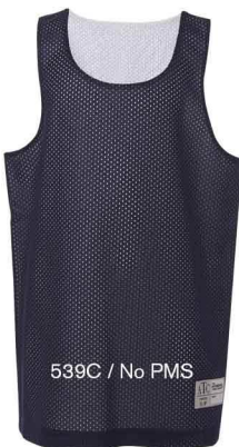
539C / No PMS