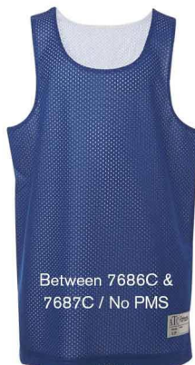
Between 7686C & 7687C / No PMS