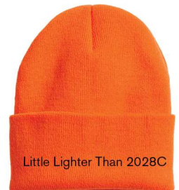
Little Lighter Than 2028C