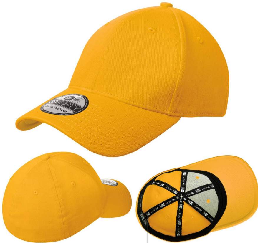
NEW ERA® taping on inside seams

Adult Sizes: S/M (7 1/8 - 7 3/8), M/L (7 3/8 - 7 5/8), L/XL (7 5/8 - 7 7/8)