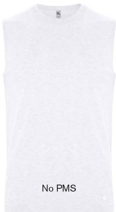
WHITE FLECK TRIBLEND

Textile fabric colours are subject to dye lot variation and will not be exact match to print pantone reference