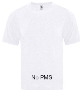
WHITE FLECK TRIBLEND

Textile fabric colours are subject to dye lot variation and will not be exact match to print pantone reference