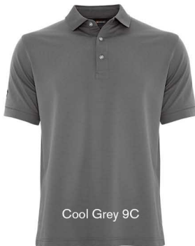
Cool Grey 9C